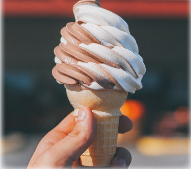
Soft Serve Ice Cream Cone