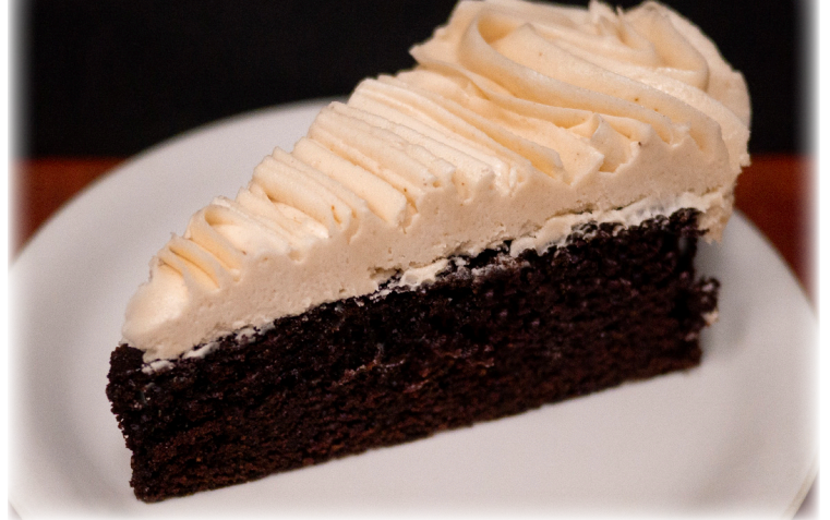
Chocolate Cake with Peanut Butter Icing

ASK YOUR SERVER ABOUT THIS MONTH'S HOMEMADE DESSERT FEATURES