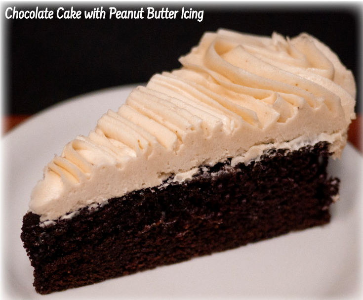
Chocolate Cake with Peanut Butter Icing

Apple, Orange, Cranberry, Tomato or Grapefruit