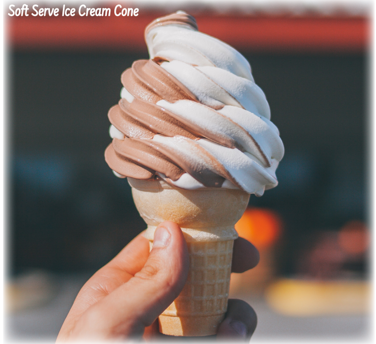
Soft Serve Ice Cream Cone

DESSERT OF THE MONTH ASK YOUR SERVER ABOUT THIS MONTH'S HOMEMADE DESSERT FEATURES